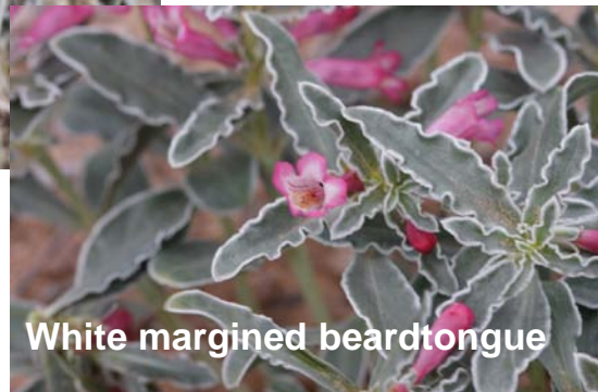
White margined beardtongue