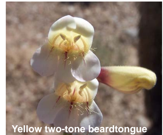
Yellow two-tone beardtongue